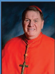
Cardinal Joseph W. Tobin, C.Ss.R.

We are inviting you to join our parish for a one-day pilgrimage to Washington DC.